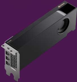
NVIDIA RTX™ A2000 Graphics Card