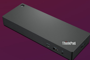
ThinkPad Workstation Thunderbolt™ 4 Dock