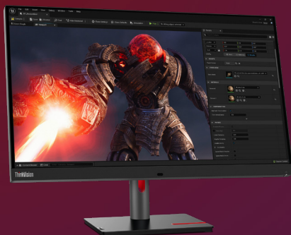
ThinkVision P32pz-30 Display