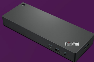
ThinkPad Workstation Thunderbolt™ 4 Dock