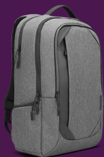
Lenovo Business Casual 17-inch Backpack