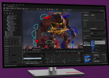
ThinkVision P27h-30 Display