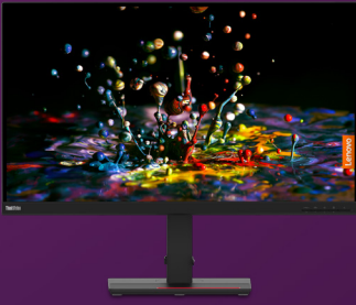
ThinkVision P32p Display