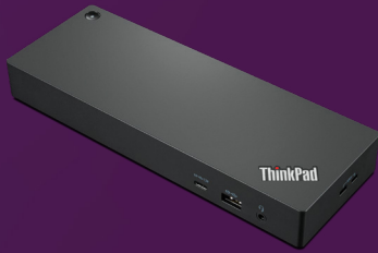
ThinkPad Workstation Thunderbolt™ 4 Dock