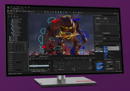
ThinkVision P27h-30 Display