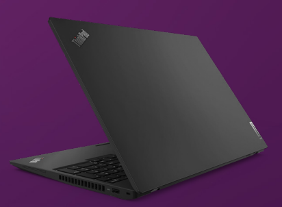
Modern Design Built with sustainable materials and certifications, and a choice of Thunder Black or Storm Grey chassis