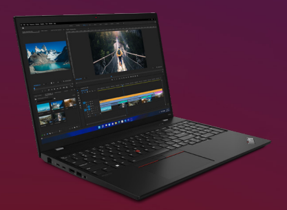
ISV Certifications Certified by many of the leading industry software applications

The latest security features including dTPM 2.0, an embedded chip dedicated to storing encryption keys